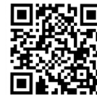
St Cuthbert, Edinburgh

No Cash to donate? – donate on-line with this QR code. This safe system run by the Archdiocese makes it easy.